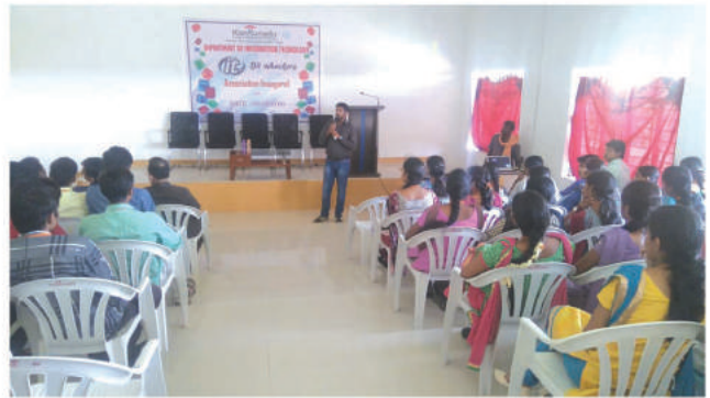
Guest Lecture ETL