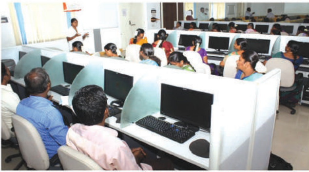
Computer Training Program