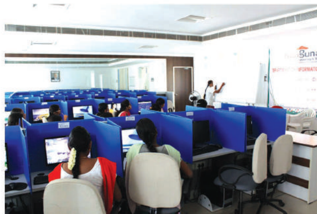
Value added Course on C and C++

College of Engineering and Technology, Thottiam on 10.06.2016 and 11.06.2016.