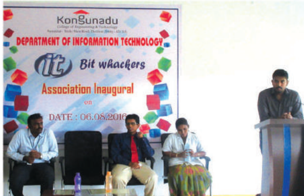
Inauguration of IT Association