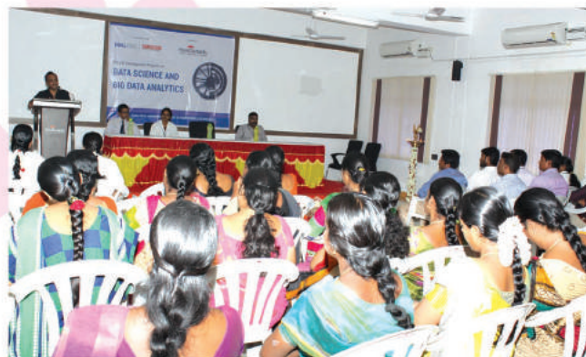
FDP on Data Science and Big Data Analytics

Organized a Faculty Development Programme on “Data Science and Big Data Analytics” jointly with Department of CSE on 14.11.2016 to 18.11.2016. The training was conducted by DELL EMC and ICT ACADEMY.